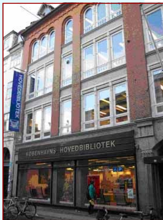
Copenhagen Central Library is housed in an old building.