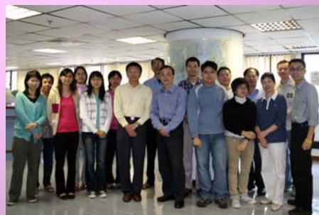
Our working team