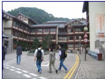
Entrance of Chi Lin Nunnery

The library was established in 1982 and has started automation since 1996. The library has a floor area of 10,000 sq.ft.. It houses a total of 80,000 volumes which are mostly obtained by donation. The greater part of the library collection is composed of Chinese Tripitaka, rare books, scriptures on Buddhist Studies, Buddhist Literature, Buddhist Architecture, Philosophy and Arts. The main users are Chi Lin nuns, staff and students taking Buddhist studies. It is open to the public. The vision of the library is to promote the circulation to more readers through online co-operation with other Buddhist organizations.