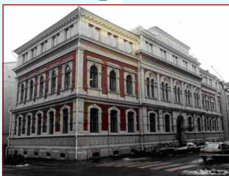
The Rikhardinkatu Library (1882) has long been the old main library of Helsinki City Library system for over a Century.

environments, the social consciousness as well as the cultures of readership here and there that substantively lead to differences in some services. For instance, all public libraries there provide home delivery services to the aged, the sick, the handicaps and whoever in need. However, that may not be practical to Hong Kong situation due to its own social factors, say, the enormous population size or different social security policies. Population size and limited resources do create some problems in providing public services in Hong Kong. Public libraries in the Nordic countries obviously can provide better resources shares to readers as the budget, collection and circulation rates per capita, etc. are generally much higher than that in Hong Kong. Besides, readers in the Nordic countries normally have more leisure capacities in using library services.