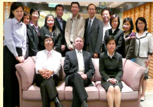
Hong Kong Library Association Council Members 2007