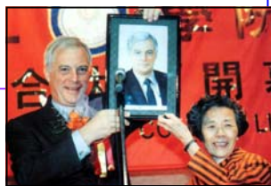
The Governor, Sir Chris Patten attended the opening ceremony of Library Complex (1995)

the development strategy and implemented the second generation library integrated system, INNOPAC