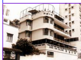
Happy Valley campus (1971)