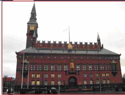
The Danish City Hall (1892). The collections of Rådhusbiblioteket are specialized in the history and culture of Copenhagen and Denmark.