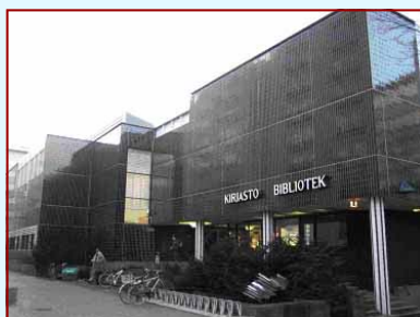
Pasila Library (1986), the main library of Helsinki City Library system.

The library was opened in 1986, replacing the old Rikhardinkatu Main Library (1882)