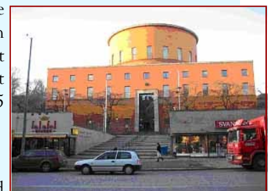
The Asplund Library (1928). The famous “Rotunda” is the symbol of the Stockholm Public Library.