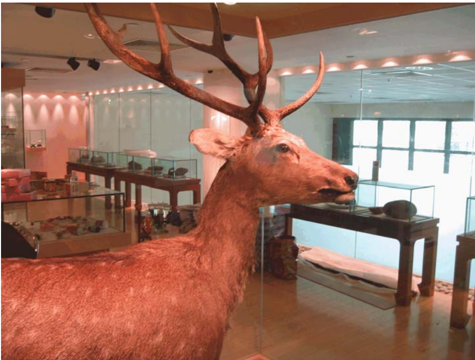
Display of Chinese Medicine Treasures

The Bank of China (Hong Kong) Chinese Medicine Centre was established in October 2003 and displays precious Chinese Materia Medica collected from all corners of the world. Members were fascinated by the display of various unique features of Chinese Materia Medica in Hong Kong including commonly used Chinese medicines, reputed and quality proprietary Chinese