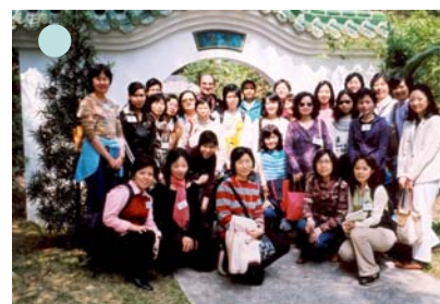
Educational Tour of the Herbal Garden