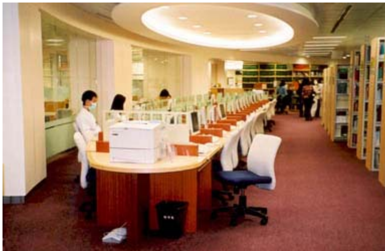
Li Ping Medical Library – Sophisticated Computer Workstations Area

while the pre-clinical, nursing and pharmacology materials are integrated with the University Library collection. The design of the Computer Workstations Area, installed with 30 networked computers, is both sophisticated and innovative. We were particularly impressed by the 24-hour Study Room which is equipped with 139 study carrels, wireless LAN and security surveillance. This 24 hour Study Room provides a comfortable area where students and on-call medical personnel can quietly study through the late or early hours. We also appreciated the energy saving and preservation provisions in the bound journals section. The motion-activated light in this section allows minimal lighting when not in use.